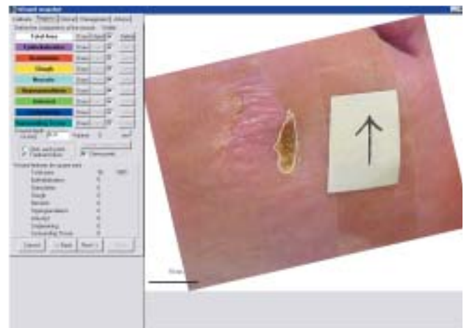
Figure 3. AMWIS information as at 25 May 2003, 2 weeks prior to discharge.

“... it was a good thing that he was commenced on OABs. Diabetics with small vessel disease and neuropathy have reduced erythema and sensation and, as these are two of the signs and symptoms of infection, it is frequently missed or not recognised as being significant. So one looks for other signs such as deep sensation, oedema or exudate. The wound looks slightly smaller though. Removal of the surrounding callus is important”.