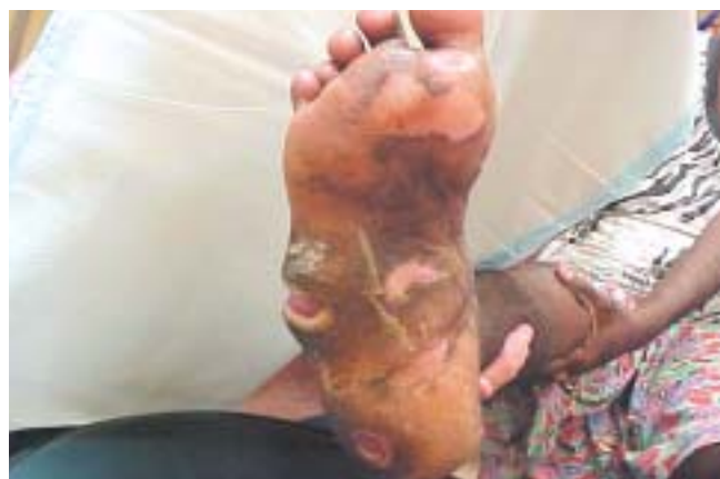
Figure 1. Kimberley patient with diabetic neuropathic foot ulcer complicated by Hansen's disease.

Telemedicine systems have been suggested as potentially offering benefits to remote communities because of their capacity to provide rapid communication for consultation,